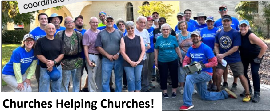
Churches Helping Churches!